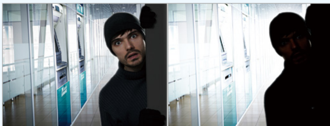
With WDR Pro